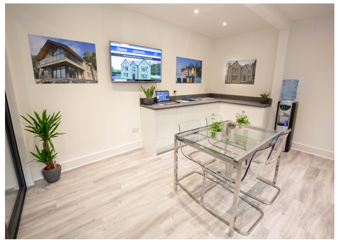
Dedicated meeting space to discuss all of your aluminium glazing requirements

This includes input on structural steel work, how to safeguard against cold bridging, damp protection measures and correct methods of frame fixing.